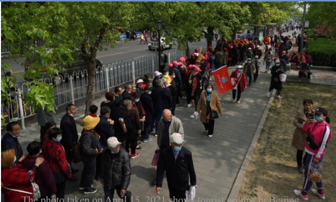
The photo taken on April 15, 2021 shows tourist groups in Beijing

China's top authority has pushed to put a pause on group trips in mid- and high-risk areas based on the fact that nearly 80 percent of confirmed COVID-19 cases have been related to the travel groups in the recent flareup.