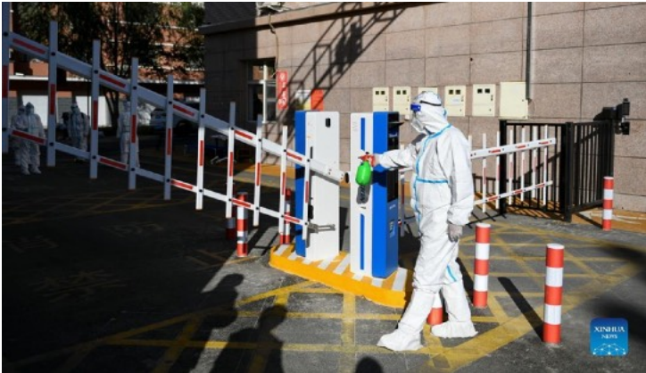
A medical worker disinfects facilities at a residential area in Ejina Banner of Alxa League, north China's Inner Mongolia Autonomous Region, Oct. 20, 2021.

The China-Mongolia border city of Ejina Banner, one of the regions hit the hardest in the latest coronavirus flare-up, issued an emergency notice on Monday that all residents and tourists in the city must stay indoors to prevent COVID-19 from spreading further. The city reported 12 new confirmed cases on Sunday, bringing the total to 43.