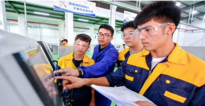
Vocational college students learn to operate CNC machines in Central China’s Hunan province on Sept. 17.

China’s top leadership has issued a guideline to promote “high-quality” development of vocational education, with the goal of expanding the share of vocational college enrollment to at least 10% of the total enrollment of higher education institutions by 2025.