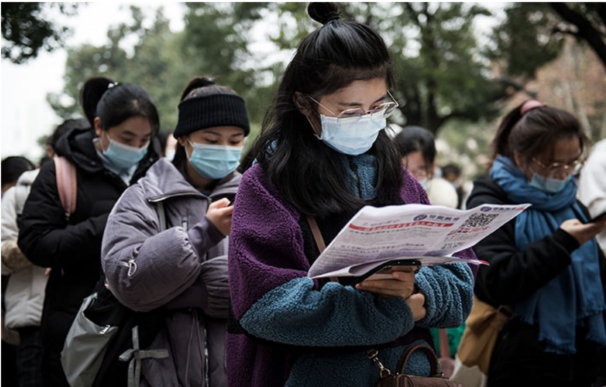
Candidates review for the National Civil Servant Examination before entering the examination rooms in Wuhan, Central China's Hubei province, in November 2020.

Out of the total, 21,000 jobs, or 67.3%, will be open to fresh college graduates, as the government seeks to boost employment in this specific group, according to the state-run Xinhua News Agency. In 2019, only 39.2% of the government positions were available for fresh recruits, according to data from Beijing Huatu Hongyang Education and Culture Development Corp. Ltd., an education service provider.