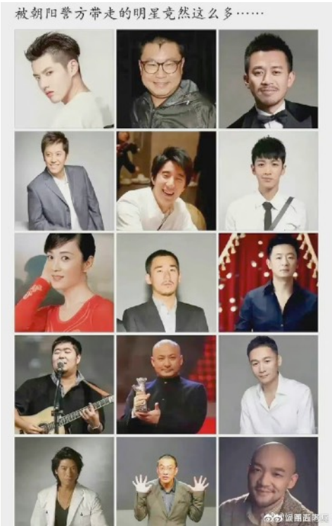
Profile photos of Chinese entertainers whose misconducts were reported to police by Chaoyang residents.

Chaoyang district, the largest urban district of Beijing, is home to 140,000 Chaoyang masses who cooperate with the police. Xinhua reported in 2018 that Chaoyang masses reported 8,300 valuable tip-offs to Chaoyang police, leading police to crack 370 cases and detain more than 250 suspects.