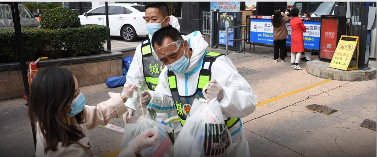
City management personnels hand over send daily supplies to residents in Lanzhou, Gansu province, Oct. 20, 2021.

So far, officials haven't disclosed if the infected patients have been vaccinated against COVID-19. China has so far administered over 2 billion vaccine doses against the coronavirus, with at least 78% of its population fully vaccinated, according to the country's top health authority.